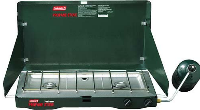
Coleman 2-burner Propane stove